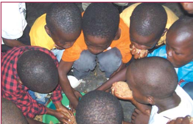
Children from Liberia eating FMSC food

Sunday, to hear more news and updates from International Children's Fund, at 7a.m. and 8:55 p.m. at 91.9 Appleton-Oshkosh, 101.7 in Ripon and Fond du Lac, 91.5 in Green Bay, 95.5 in Two Rivers/Manitowoc, 88.5 in Wausau/Stevens Point, 94.1 in Antigo and 107.3 in Waupaca.