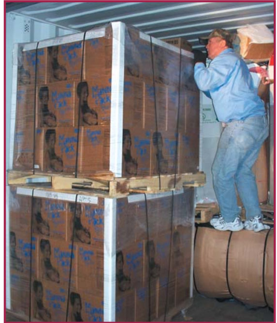
One of our volunteers packing the container