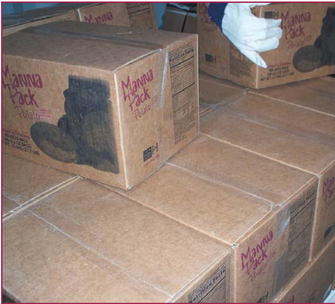
MannaPack™ potato which helps those suffering from dehydration to gain their strength