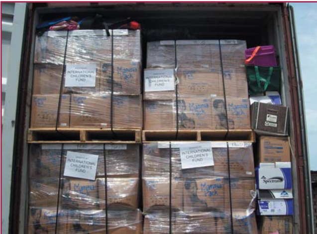
Container with FMSC food as it arrived in Liberia