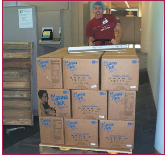
MannaPack™ food at a packing event at Thrivent