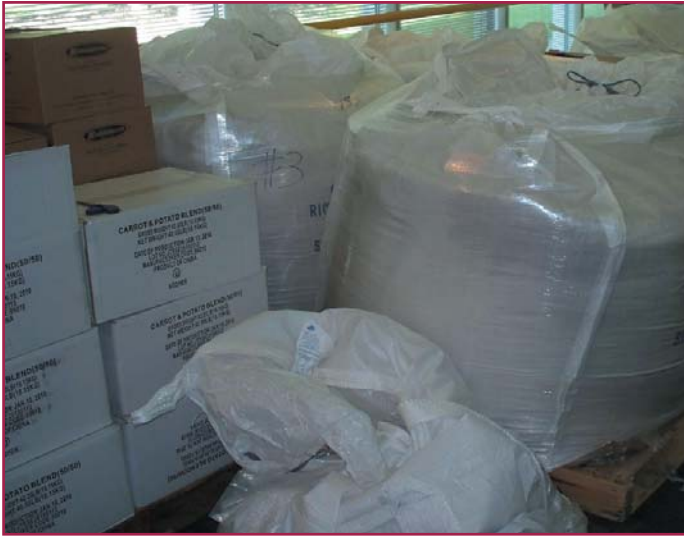
Bulk rice and ingredients for MannaPack™ food