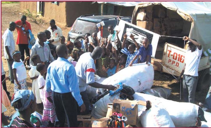
Delivery of FMSC food to rural village in Liberia

T he weakened global economy has devastated people around the world who are already suffering from natural and man-made disasters, poverty, disease, and malnutrition. It has also stretched our resources like never before. So far we've been able to continue sending food, pharmaceuticals, medical supplies, clothing, and other critical aid to people in crisis in places like Ghana, Kenya, Liberia, Sudan, Uganda, Sierra Leone and Haiti. International Children's Fund works to meet the desperate needs of countless impoverished children, pulling them away from the brink of starvation, disease, and victimization.