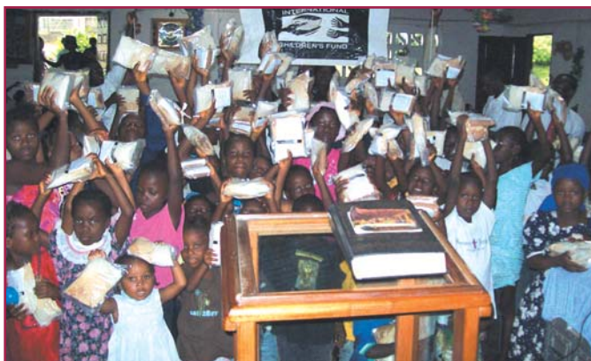
FMSC food being distributed in Liberia at a rural church